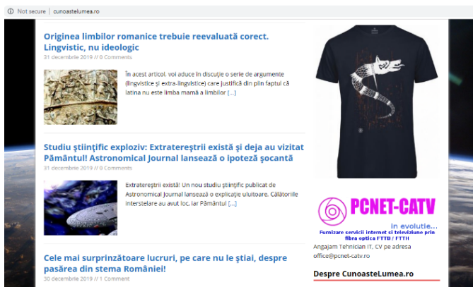
Figure 1 Print screen cunoastelumea.ro landing page 1 January 2020

The “true” intentions or the motivation of misinformation sites are difficult to identify without access to their owners or editors. In particular, and in relation to ideological and political goals, how can we decide if a site is a “true believer” or merely a “money spinner” using ideology to sell a product? While this distinction is slightly artificial – most sites will probably be both – it does exist to some degree. What I define as “true-believers” are websites that are consistent and coherent in pushing an ideological agenda. The topics (which are often quite niche: Dacian history or ultra-Orthodoxy), the symbolism, the website’s name (the Dacian Wolf, True Orthodoxy, Radio Wall) and their related media (videos, photos) and social media channels will have an overarching theme or identity. The “money-spinners” also have an ideological agenda, but it will be less coherent: they cover a large number of unrelated topics (health, paranormal activities, current politics), they will have some sensationalist titles, they tend to have names that are generic and media-related (active news, recent news, exclusive news), and they are more inclined to define themselves as “news sites.” While the “true-believers” often cover current affairs and political events, they often define themselves as opinion, cultural, or historical media outlets.